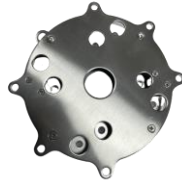
970 Damping Bracket