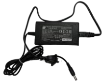
AC24V/2.2A Power Adapter